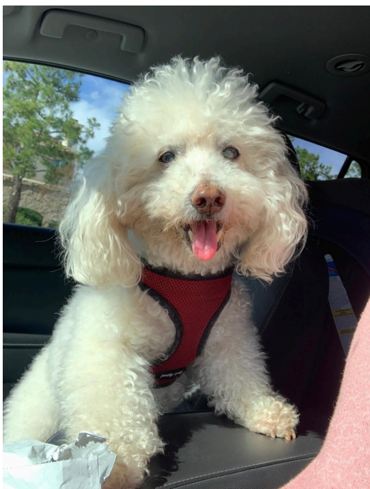
Snuggles in his later years, on a car ride with his momma.