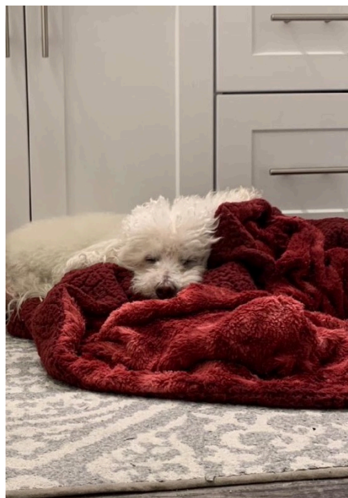
Naps are good at any age.